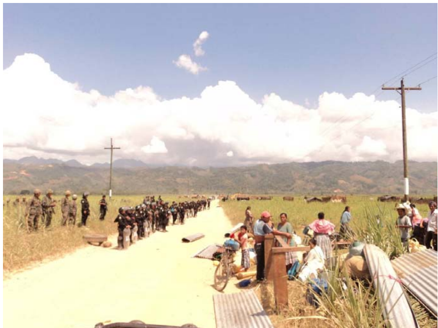
Miralvalle, Polochic Valley, Guatemala, 15 March 2011. The community was evicted, their houses and crops destroyed.

The new wave of land deals is not the new investment in agriculture that millions had been waiting for. The poorest people are being hardest hit as competition for land intensifies. Oxfam's research has revealed that residents regularly lose out to local elites and domestic or foreign investors because they lack the power to claim their rights effectively and to defend and advance their interests. Companies and governments must take urgent steps to improve land rights outcomes for people living in poverty. Power relations between investors and local communities must also change if investment is to contribute to rather than undermine the food security and livelihoods of local communities.